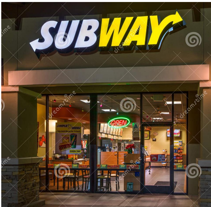
This is a placeholder image for previewing purposes only.